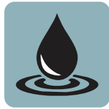
POTABLE GROUND WATER