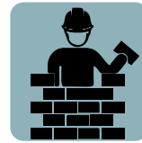
READY FOR CONSTRUCTION